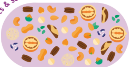
nuts & seeds

biotin pantothenic acid vitamin B6 thiamin