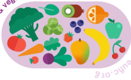
fruit & vegetables

vitamin A vitamin C pantothenic acid folate