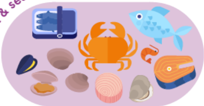
fish & seafood