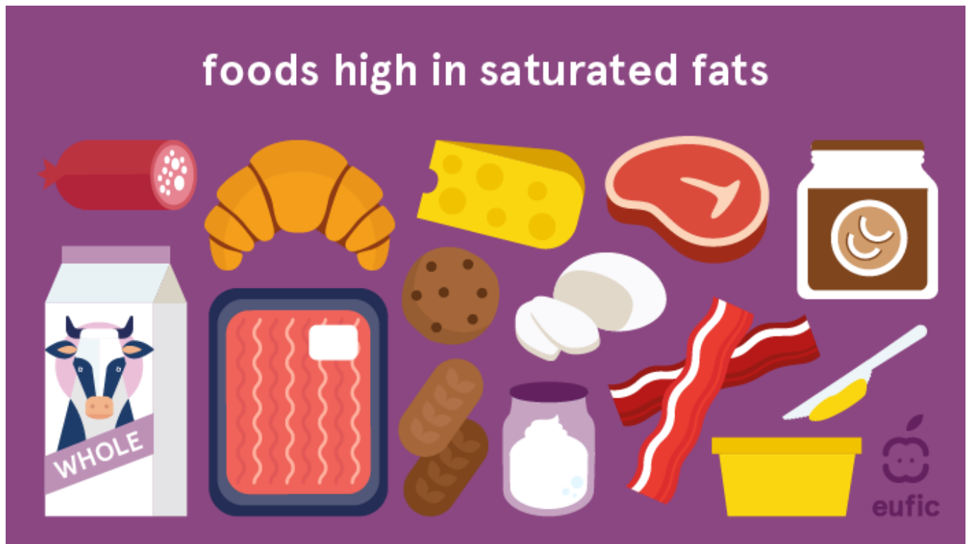
Figure 2. Foods high in saturated fats 1 .