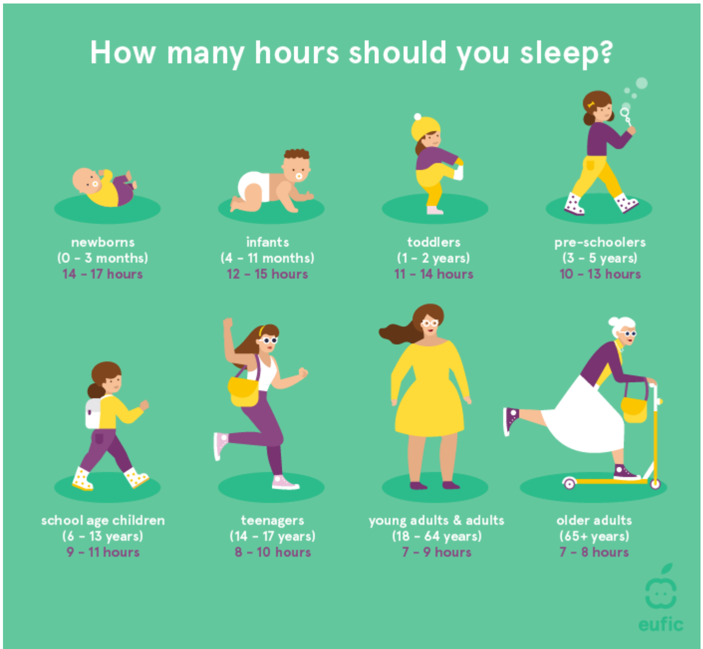
Figure 5. Recommended hours of sleep for different ages. 2