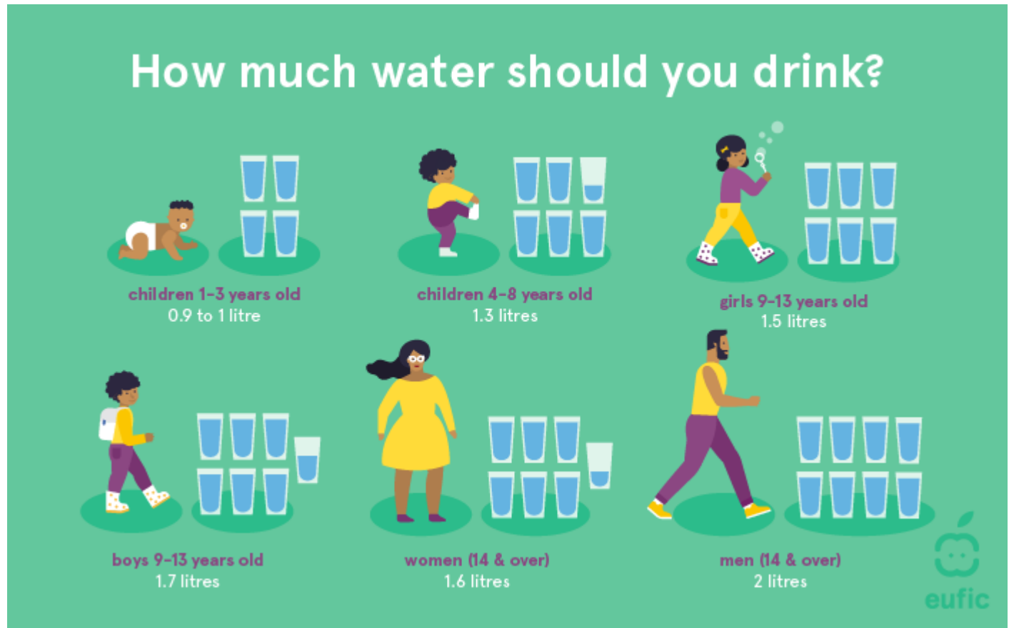
Figure 3. Water recommendation for different age groups set by EFSA. 1

If you have access to safe tap water, this is the healthiest and cheapest drink. For a refreshing boost, you can add slices of lemon, cucumber, mint or berries. Other drinks such as unsweetened coffee and tea or iced tea, or unsweetened, infused or flavoured (sparkling) water are also good choices for hydration.