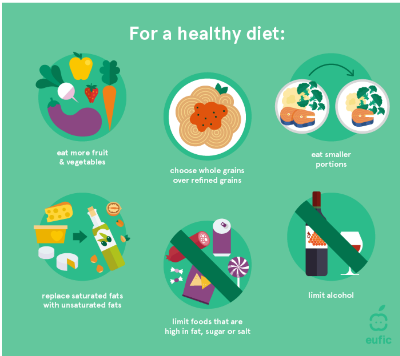
Figure 1. Healthy eating