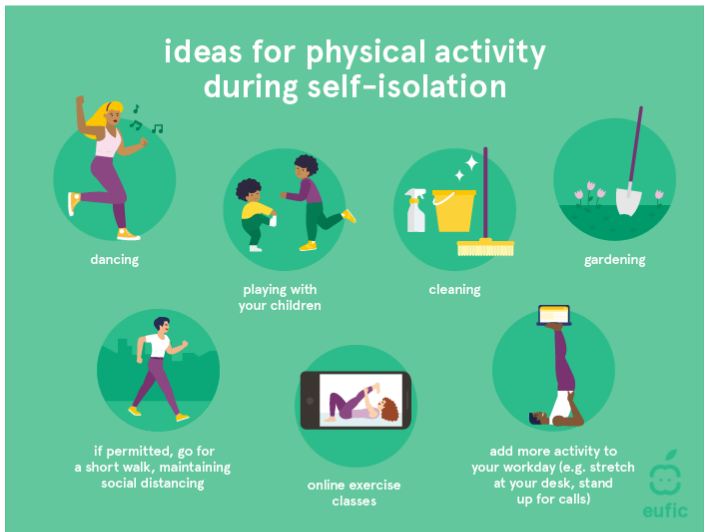
Figure 4. Ideas for physical activity during self-isolation.

For more information see WHO European Region - Stay physically active during self-quarantine