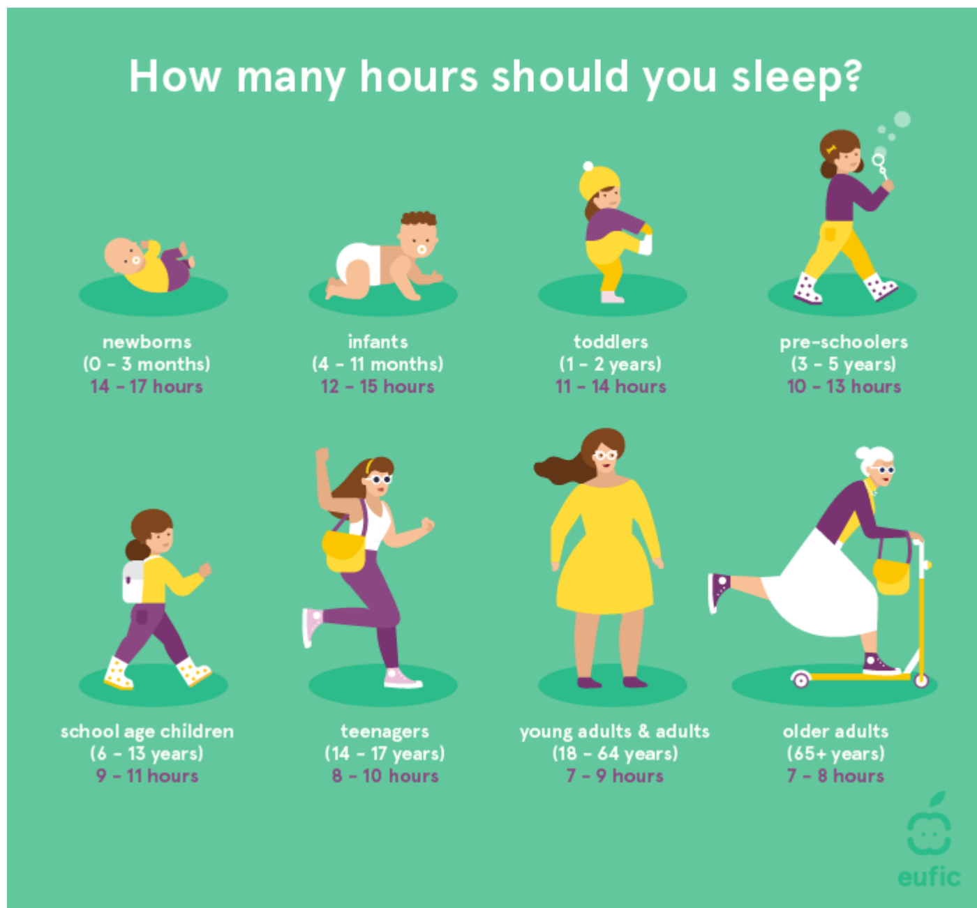
Figure 5. Recommended hours of sleep for different ages. 2