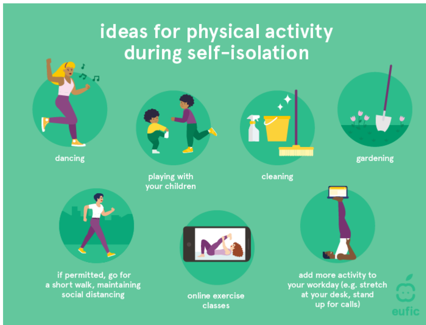
Figure 4. Ideas for physical activity during self-isolation.

For more information see WHO European Region - Stay physically active during self-quarantine