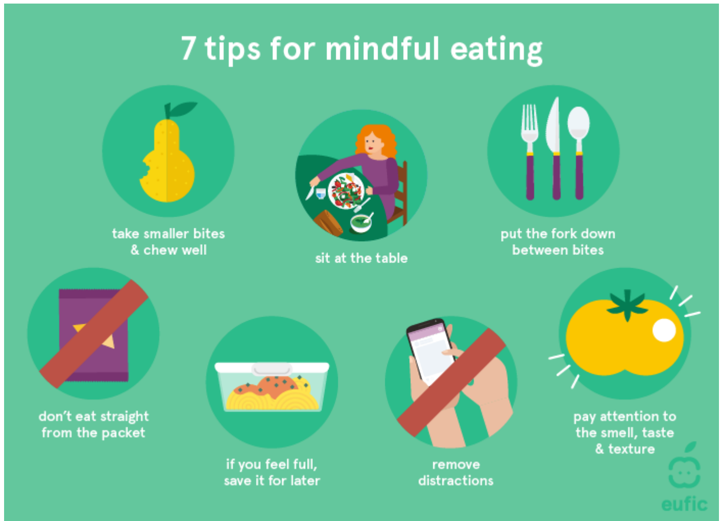
Figure 2. Tips for mindful eating.