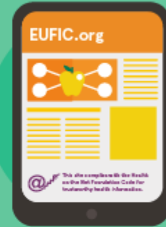
certified with a trusted information mark