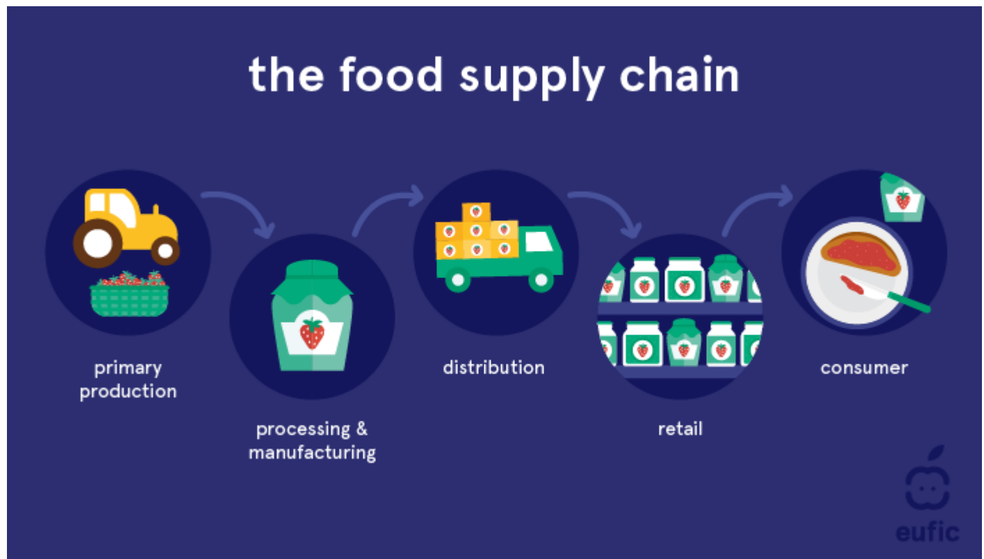
Figure 2. The Food Supply Chain

By using LCAs, researchers have found that the global food system accounts for around 26% of the world's greenhouse gas (GHG) emissions. 1 However, there are big differences in how much GHGs different types of foods emit. In general, fruit and vegetables have lower GHG emissions compared to animal products such as beef and dairy, in fact as much as 10-50 times lower. 1