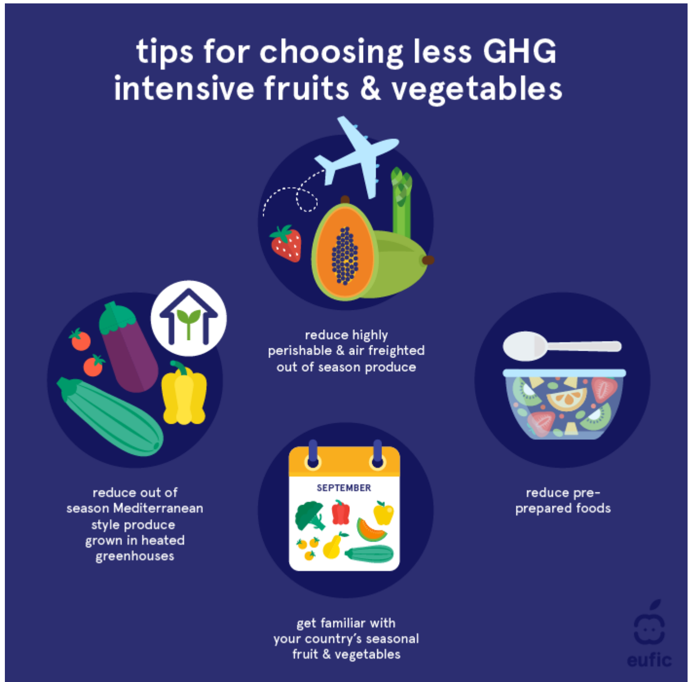
Figure 3. Tips for choosing less GHG intensive fruits and vegetables

intensive fruit and vegetables (figure 3) 7 :