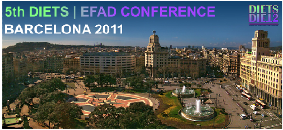
21ST & 22ND OCTOBER | BLANQUERNA-RAMON LLULL UNIVERSITY